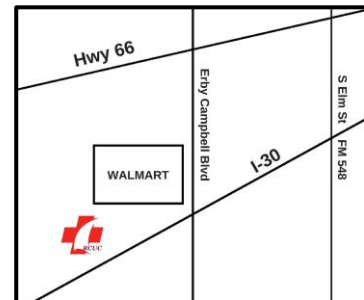
Royse City Urgent Care

Occupational Medicine/Rockwall 469-402-3420 810 E. Ralph Hall Pkwy, 75032